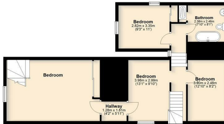
First Floor Approx. 81.0 sq. metres (871.9 sq. feet)

Total area: approx. 176.6 sq. metres (1900.5 sq. feet)